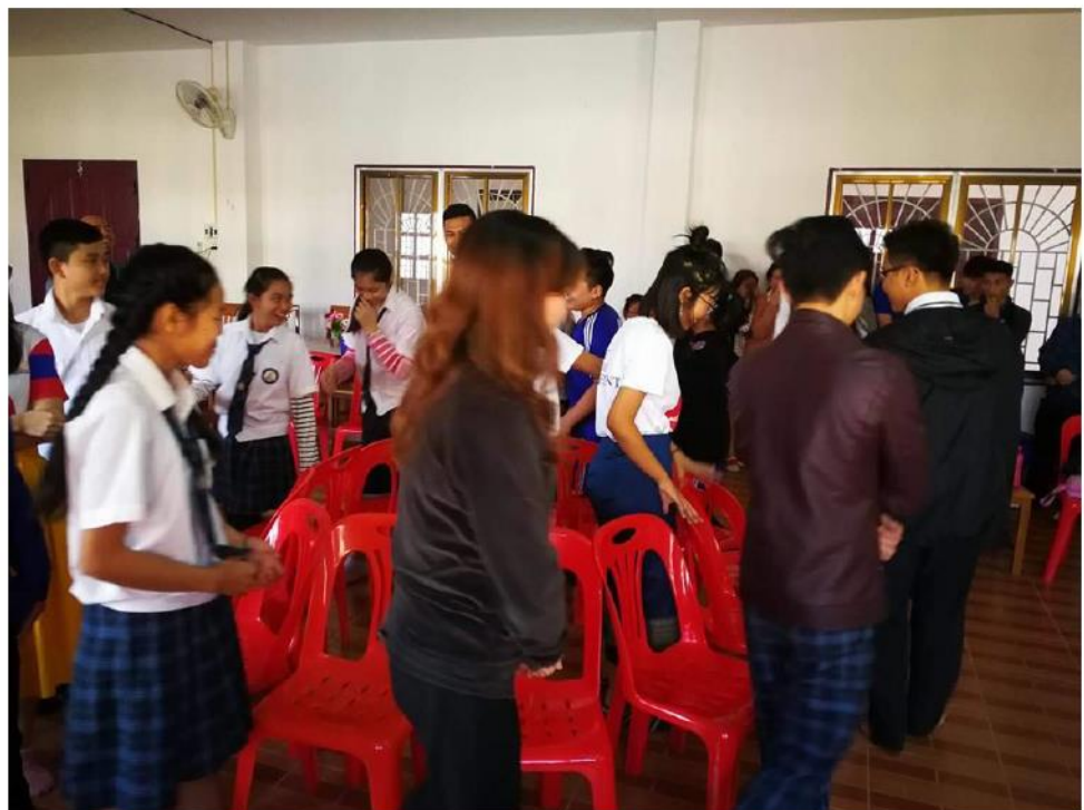
UTCC International students doing activities with the kids from Kiettisack high school