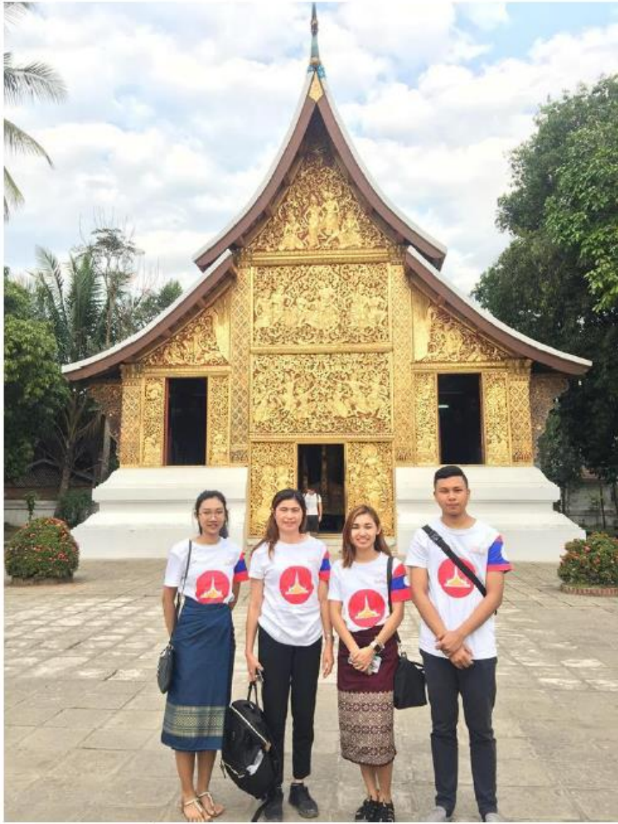
UTCC International students visited a temple in Luang Prabang