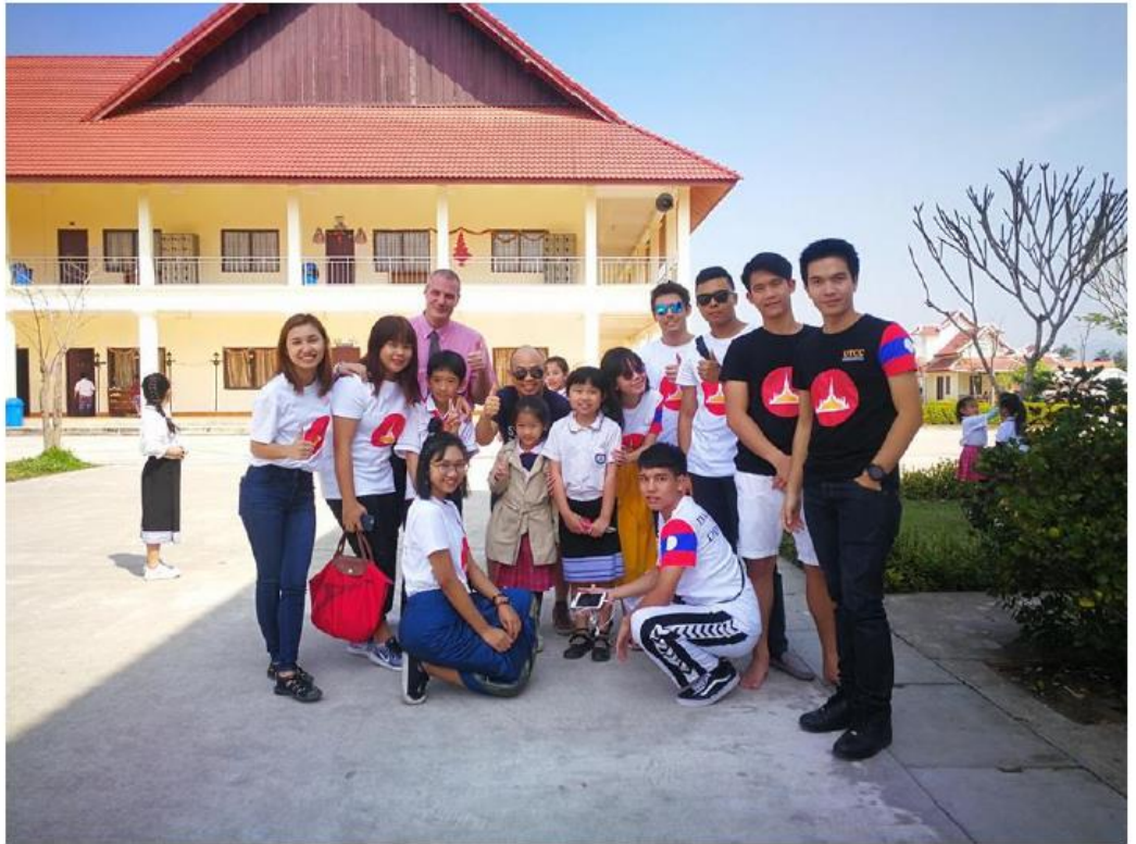
UTCC International students visited Kiettisack international high school