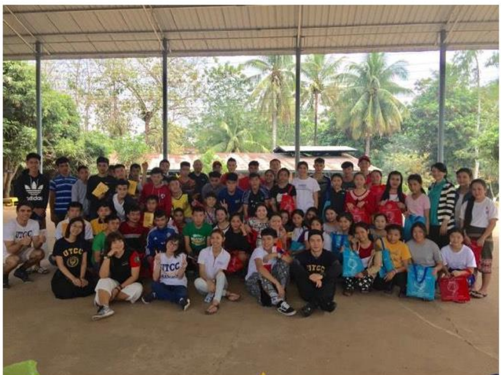
UTCC International students donated books and stuffs to E'cole Orphanage School in Luang Pranbang